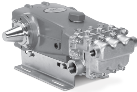
Model 2530 Shown (Shaft protector and mounting rails sold separately)