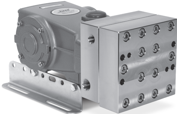
Model 781 Shown (Mounting rails sold separately)