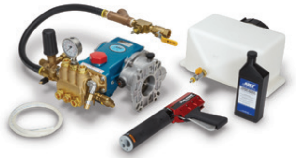
* Model 56G1FM.150 shown

Our Variable Stream Gun gives firefighters the ultimate flexibility near the fire. Simply adjust the handle from back straight high pressure stream) to forward (induce air for high expansion foam) on the go, without disrupting stream flow.