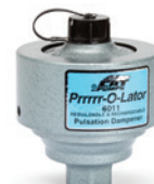
Pulsation Dampener PN 6011 100 - 7200 PSI