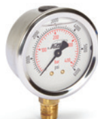
Pressure Gauge PN 6089 0 - 6,000 PSI