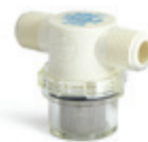
Inlet Strainer PN 7204.4 1/2" NPT(F) 10 gpm Max