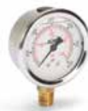
Pressure Gauge PN 6089 0-6,000 PSI