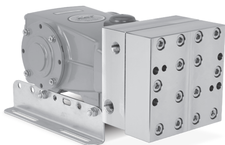
Model 781 Shown (Mounting rails sold separately)