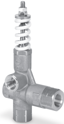
(Model 7034 shown)